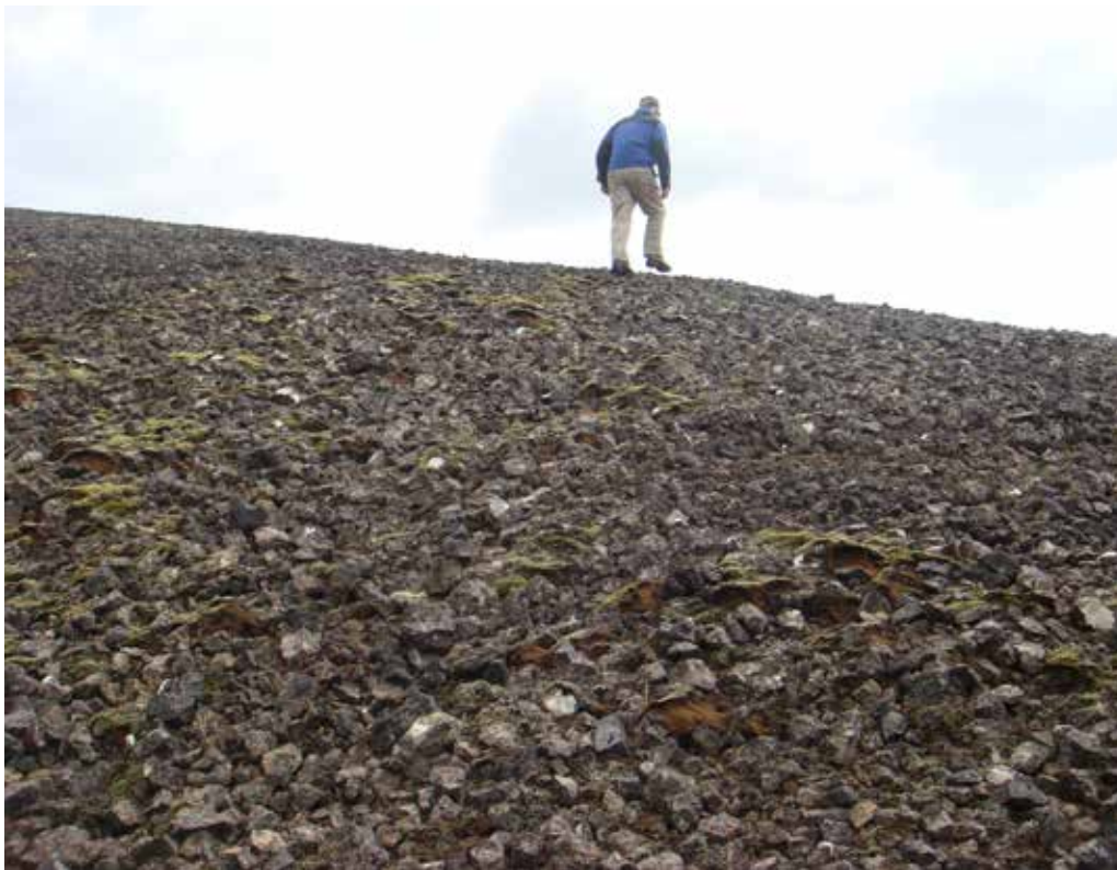
What you can expect climbing the mountain.

Those of you who decide to make the 850 foot climb up to the actual crash site will not need special climbing gear. However, it is quite steep and the mountain is covered with small loose rocks. It's also difficult descending because of the steepness and the rocks.