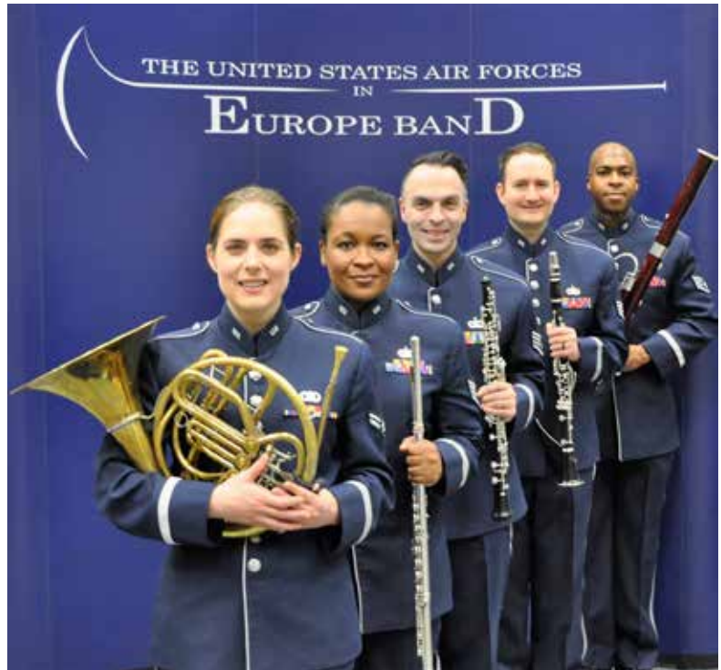
"Winds Aloft" Band

The United States Air Forces Europe Band "Winds Aloft" Woodwind Quintet is a premier component of the USAFE Band. Based at Ramstein Air Base, Germany, the five-member ensemble, consisting of the traditional instrumentation of flute, oboe, clarinet, bassoon, and horn provides diverse sounds and styles making it the prominent chamber ensemble throughout Europe.